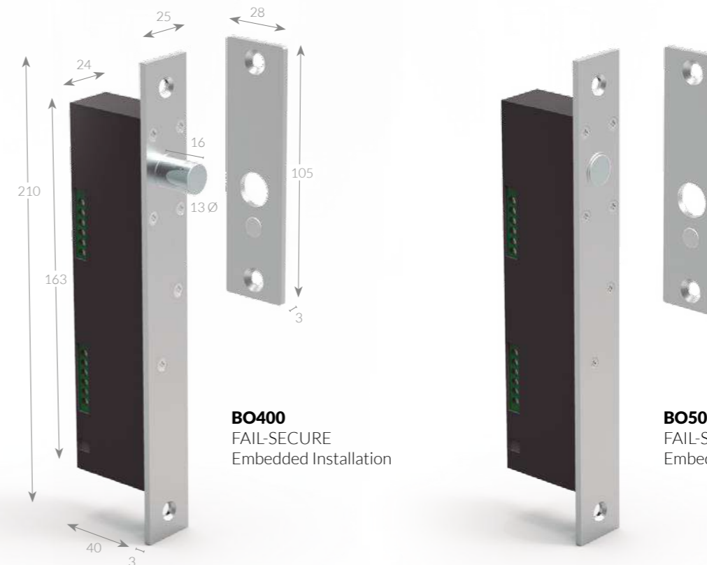
BO400 FAIL-SECURE Embedded Installation